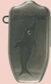
Optional protecting box